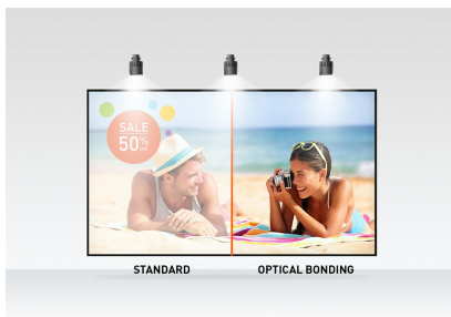
Optical bonded PCAP

The Full HD (1920x1080) Open Frame monitor ProLite TF2238MSC-B1 with IPS panel technology offers exceptional colors and wide viewing angles. The Optical Bonded Projective Capacitive (PCAP) 10-point touch technology ensures a seamless and accurate touch response and a lower light reflection, in addition, the display is protected against humidity and potential moisture development. A robust metal housing and a scratch-resistant 7H edge-to-edge glass with anti-fingerprint coating make the monitor particularly suitable for integration in demanding environments. The monitor meets also a IPX1 protection rating, making it waterproof for a period of time against dripping water. The ProLite TF2238MSC-B1 can be used in landscape, portrait and face-up orientation. A perfect solution for kiosk systems, retail and interactive digital signage installations.