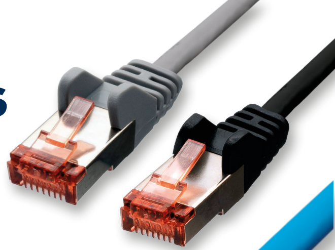
Latch protection for secure installation

Supporting a variety of cable standards, lengths and shieldings, ProXtend is your one stop shop for ethernet cables ensuring that you are always able to find a cable that best suits your network requirements.