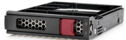
Low Profile Converter (LPC)