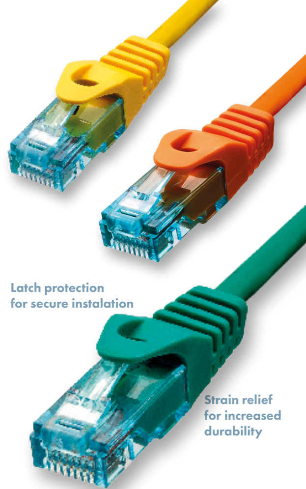
50"U Gold plated RJ45 connectors