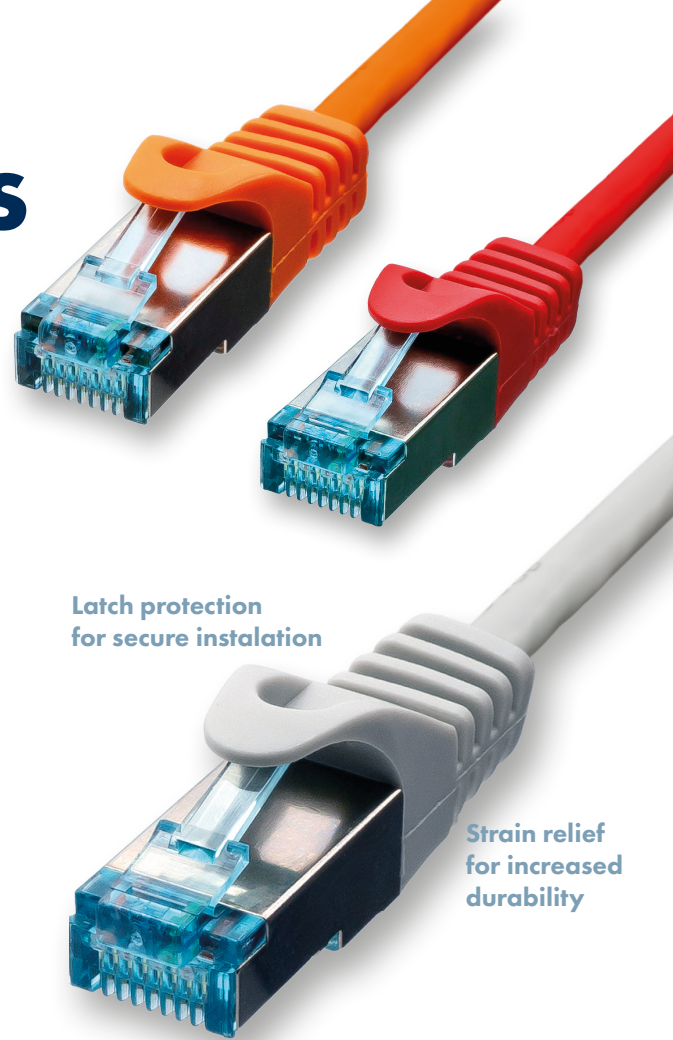
50"U Gold plated RJ45 connectors