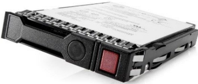
Smart Carrier (SC)