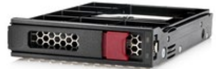
Low Profile Converter (LPC)