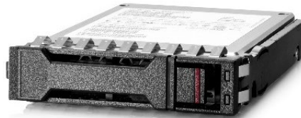
Basic Carrier (BC)